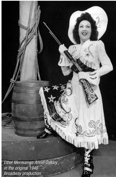
Ethel Merman as Annie Oakley in the original 1946 Broadway production.