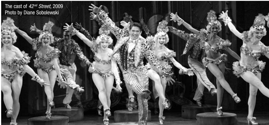
The cast of 42 nd Street, 2009